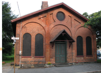
Susquehanna Stage Company