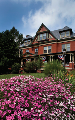
B.F. Hiestand House