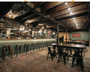
Railroad House, Perry Street Cellar