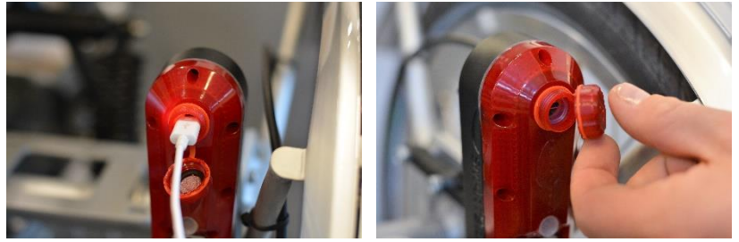
Turn counterclockwise to open the lid. Use the USB charger that came with the kit.

It is important to create good charging routines! It is recommended to charge approximately after every fourth trip to make sure you always have enough battery. When charging, use the charger provided. A fully charged battery when using a charger is signaled by a green light after about 3 hours. The controller uses a CR2032 battery.