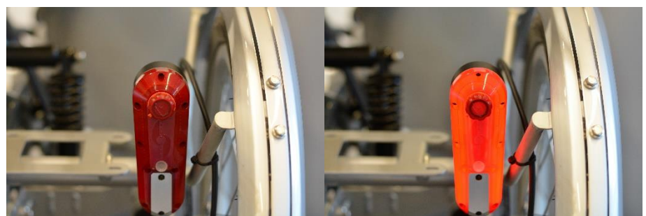
Brake unit without brake light

Signal failure: The signal between the brake lever and the brake unit is broken, either due to distance or interference. The range is about 30 meters.